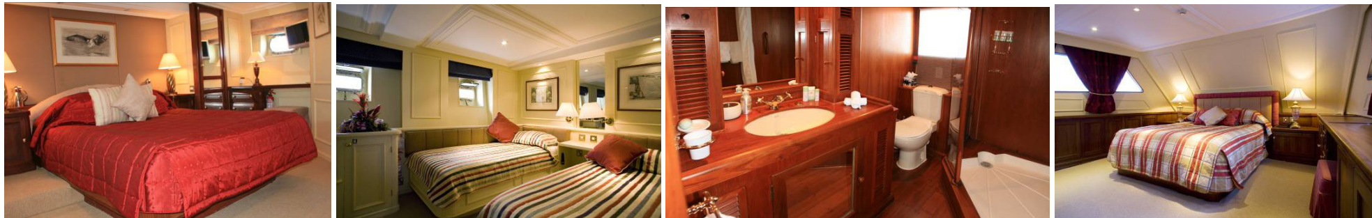
Guest accommodation to the highest of standards with a luxurious yet comfortable feel