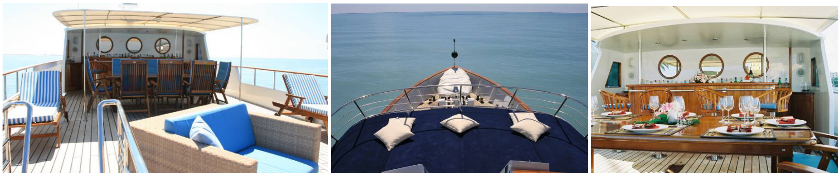
Spacious and inviting throughout to add to your enjoyment