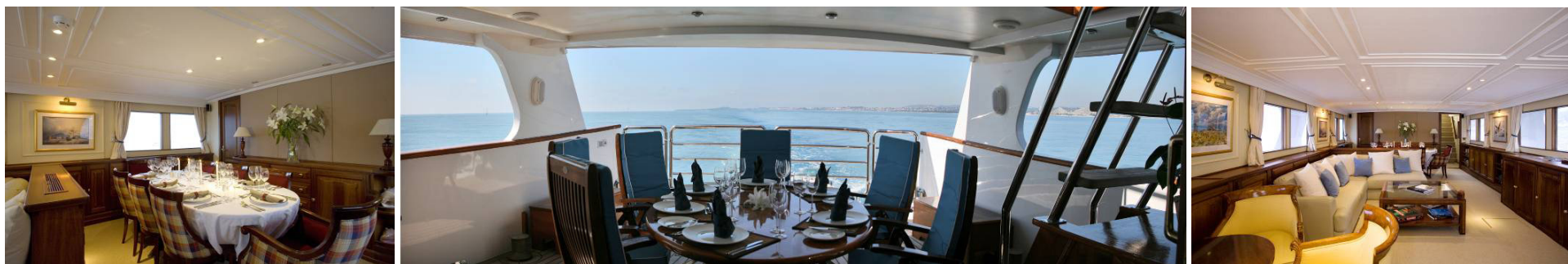
Elegant dining and living space, both inside and out